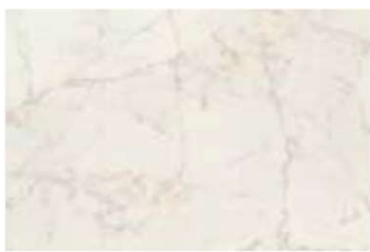
3458 PE casablanca