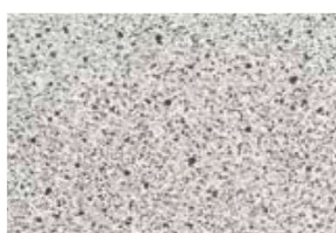
4287 PE granit svetli