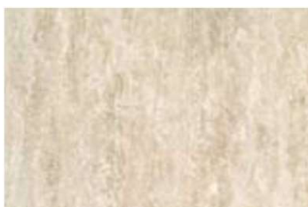
37910 PE tibur