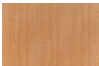
3381 PR bukev