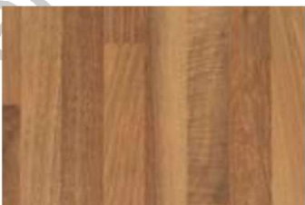
3324 PE oreh